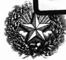
EXHIBIT tabbies 11